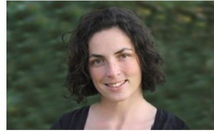
Africa making waves in the cruise market