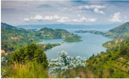
Rwanda's Lake Kivu a worthy follow-up to an unforgettable gorilla trek