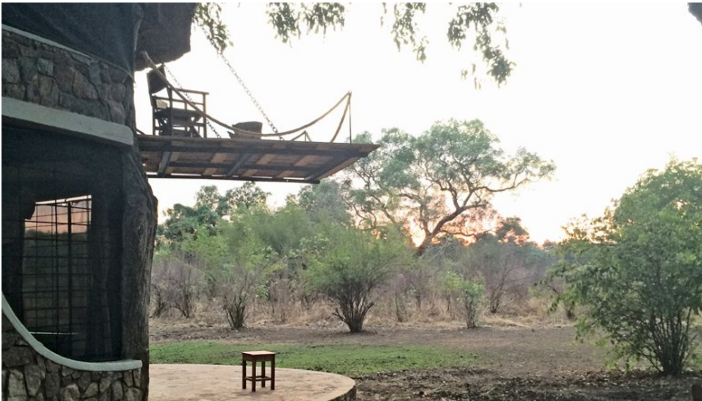
Robin Pope Safaris' Luangwa Safari House in Zambia.