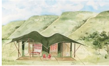
Maasai Mara lodge introduces a seasonal safari camp