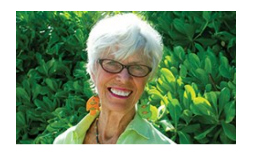
Caribbean nations put coronavirus protocols in place