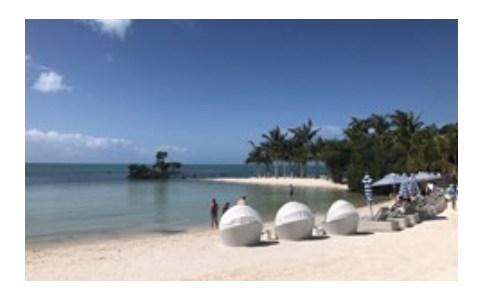
An escape from the coronavirus craziness