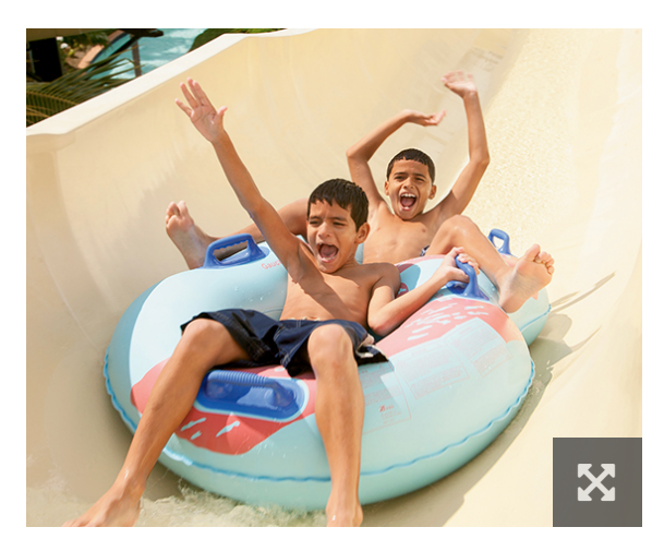
The 2-acre Coqui Water Park at El Conquistador Resort in Puerto Rico features water slides, a lazy river and an 8,500-square-foot infinity pool.

Located about 45 minutes from San Juan Airport, the property sits atop a rugged cliff overlooking the Caribbean Sea — it has great curbside (or, in this case, boatside) appeal.