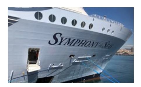
CLIA agrees to temporary halt of cruising from U.S. ports