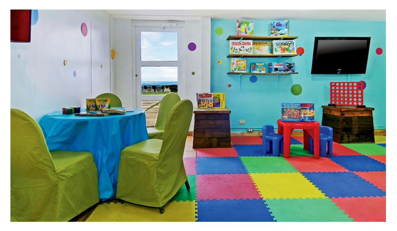
The children's activity area at Condado Plaza Hilton in Puerto Rico.

If parents are into gaming, they'll be pleased to note that the property boasts the largest casino in Puerto Rico. With 571 rooms, the property has two towers, offering balcony views of the Atlantic on one side and the lagoon on the other. There are eight restaurants, from the upscale Pikayo to the casual Cafe Caribe. There are also three pools: one with a swim-up bar; one with a water slide and shallow area for toddlers and babies; and a saltwater pool.