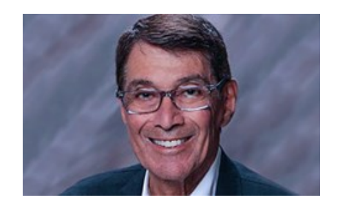
Friends & Colleagues