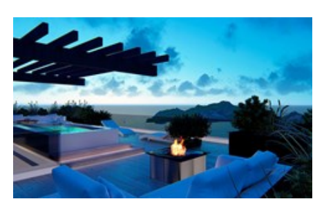
Ground breaks on Royal Mill resort in St. Vincent