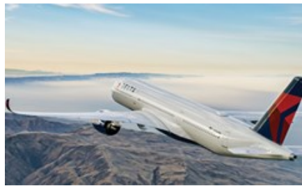
OAG: Europe flight ban to affect Delta most