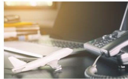
Agents find it helps to keep calm and communicate with clients