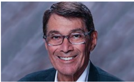
Friends & Colleagues