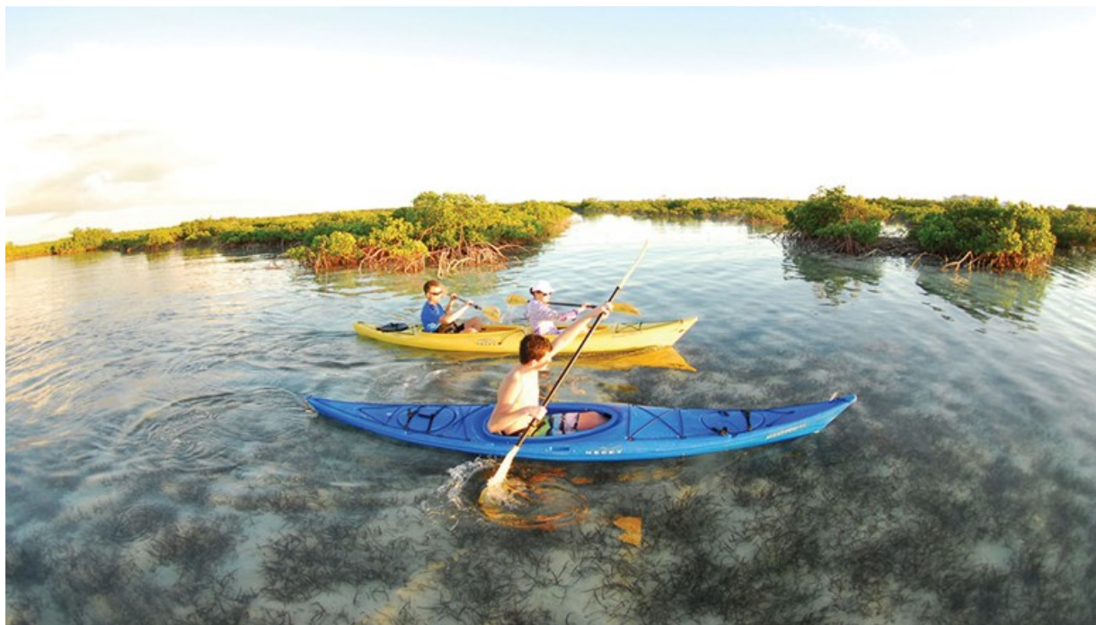
A kayaking tour on Providenciales' Mangrove Cay with Big Blue.

Ocean Club also boasts plenty of amenities; two good-size pools, a spa run by Spa Tropique (I got one of the best massages I've ever had there), a fitness center, complimentary bikes (you can bike around Providenciales, the island the resort is on, as well as the Salt Mills Shops) and tennis courts (also complimentary). You can also book sailing, snorkeling/diving, fishing, parasailing and golf for additional fees.