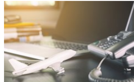
Agents find it helps to keep calm and communicate with clients