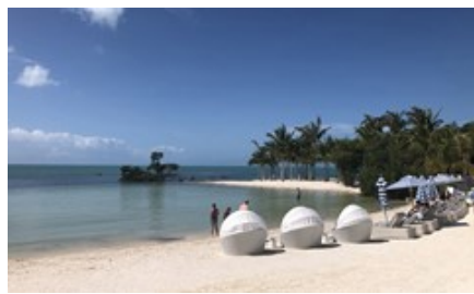
An escape from the coronavirus craziness