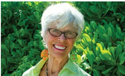
Caribbean nations put coronavirus protocols in place