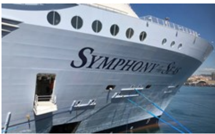
CLIA agrees to temporary halt of cruising from U.S. ports