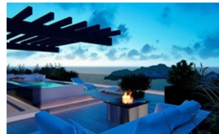
Ground breaks on Royal Mill resort in St. Vincent