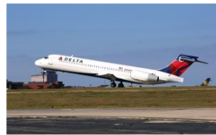
Delta parking up to 300 planes in 40% capacity cut