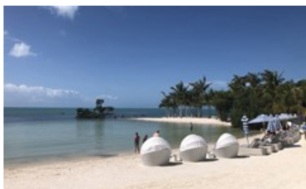
An escape from the coronavirus craziness