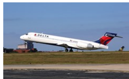
Delta parking up to 300 planes in 40% capacity cut