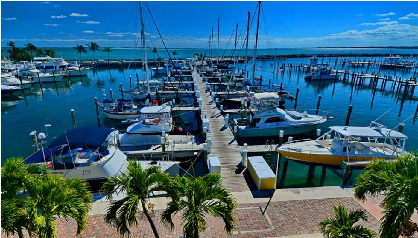
The resort's Boat Harbour Marina is the starting point for a number of fishing excursions.