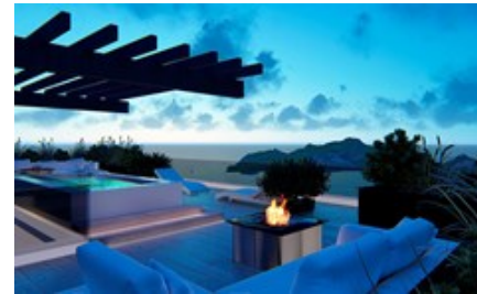
Ground breaks on Royal Mill resort in St. Vincent