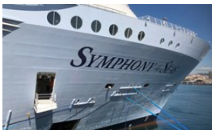
CLIA agrees to temporary halt of cruising from U.S. ports